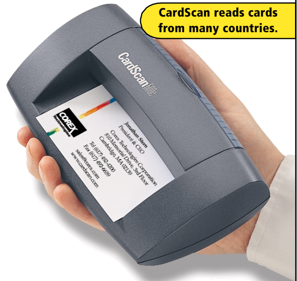
Version 6 Software

CardScan.Net is an online address book. Simply save your CardScan file onto the secure CardScan.Net server. Then access your business card collection through any web browser, using your unique user name and password.